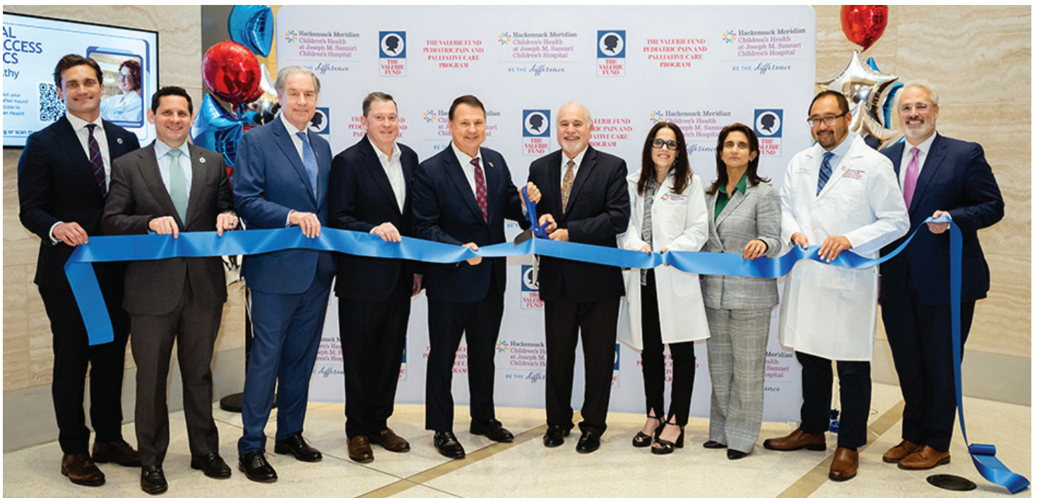
Leaders from Hackensack Meridian Health, Hackensack University Medical Center, Joseph M. Sanzari Children’s Hospital and The Valerie Fund held a ribbon cutting to announce the expansion of its Pediatric Palliative Care Program thanks to a generous gift from The Valerie Fund.

The Valerie Fund has always been—and will always be—all about the kids and the families who love them!